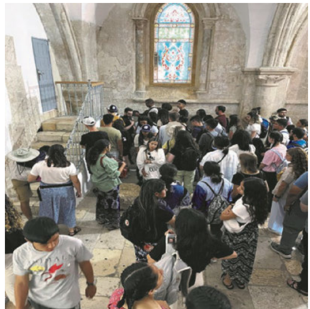
The upper room.